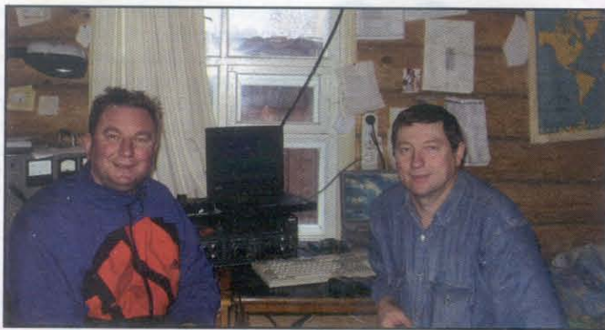
RU3DX and UA3DPX multi-op in the CW contest using the call RU3DX.

time. Rain and snow storms both . . . N8XA/QR . Being in the middle of the country (Kansas) I could hear many stations who couldn't hear me. Will have an amp for the next one . . . W0NEB . Great conditions for QRP . . . K3TW . My antenna failed Saturday evening and I finally fixed it in time for the last 5 minutes . . . AF1T . Getting FM5GU on the first call . . . KA1BXB . I like the new 48-hour format. This gives me three chances at the Midwest/East coast . . . WA9TZE . Excited to work all the stations with my antenna which was high in the center, but since I never got to put up poles, ends were almost on the ground . . . W8KNO . D4B called me . . . N7ZT . Next year we need to get out of the city and away from the noise . . . N7WL . Working all continents in less than 4 hours . . . W4DR . Stayed within the ARRL Bandplan for the whole contest. This was a big mistake . . . W3TS . Hard work on QRP but working Mexico and Canada made it worthwhile . . . KK0G . I had to install a filter to get rid of AM broadcast interference . . . WB6FRM . Low Windom was not very effective for transmit . . . AJ6T . High SWR on my L was caused by the wind blowing the vertical portion into my guy wires . . . K0BJ . Lots of loud signals from close in but needed a receiving antenna for those farther out . . . K1KO .