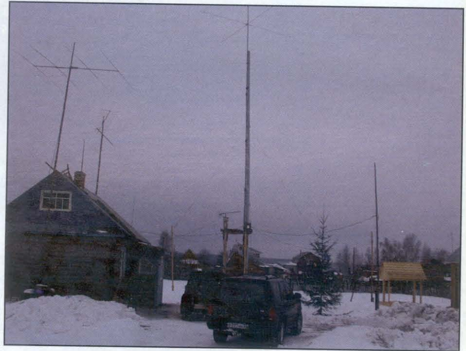
The antennas at RU3DX for the CW contest.